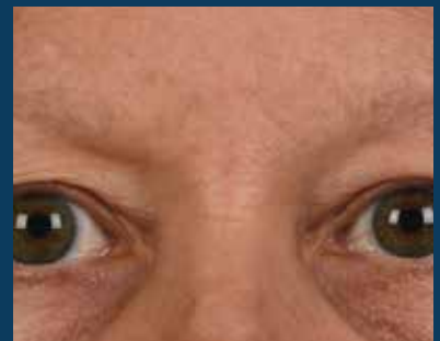
AFTER FOUR TREATMENTS Results may vary