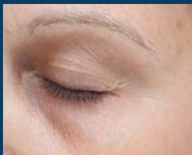
AFTER FOUR TREATMENTS Results may vary