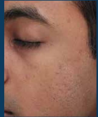
AFTER TWO TREATMENTS Results may vary