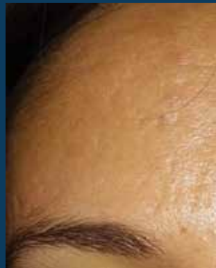
AFTER THREE TREATMENTS Results may vary