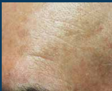
AFTER FIVE TREATMENTS Results may vary