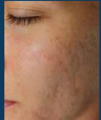
AFTER SIX TREATMENTS Results may vary